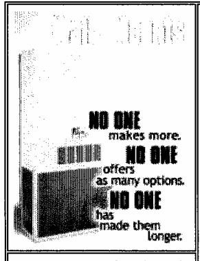
WA Technical Information Link